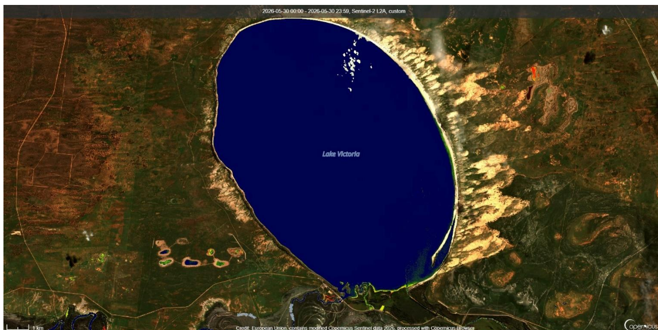
Figure 4: Lake Victoria 30/05/2026 SentinelHub [CC BY-NC 4.0] NSW- RACC Custom Algae Script - TF, WaterNSW.