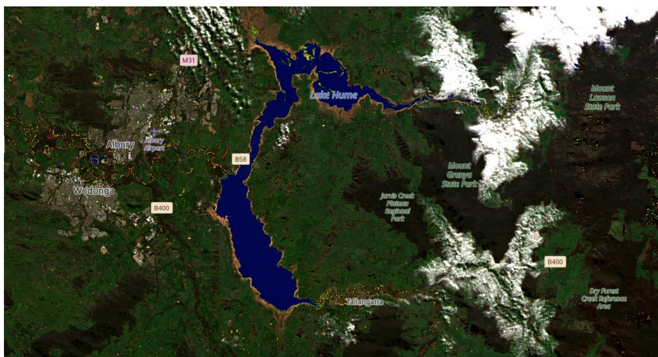
Figure 1: Hume Dam 21/05/2026 SentinelHub [CC BY-NC 4.0] NSW- RACC Custom Algae Script - TF, WaterNSW.

Lake Victoria (Figure 4) - On the 30 th of May, mostly very low phytoplankton activity was observed across the lake.