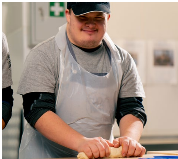
showing a person with disability rolling dough.

Employment rates for people with disability are significantly lower than those without disability across all sectors. Participation in meaningful employment is vital if people with disability are to attain economic security, retain a sense of purpose and engage effectively with others in our community.