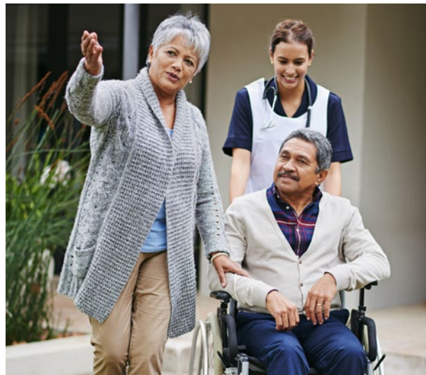
showing a person with disability engaging with health services.

A common issue for people with disability is the difficulty in navigating the systems and processes required to access the services and supports they need in the community. These difficulties are the product of a number of barriers including a lack of accessible information, inflexible processes, and limited opportunities for feedback and input.