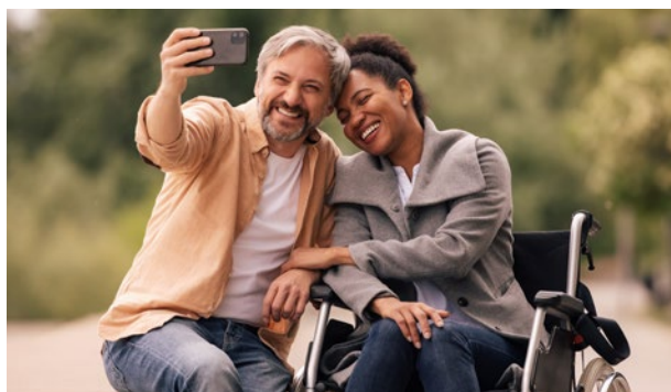
showing a person with disability in the community.

Inclusiveness and accessibility for people with disability forms a crucial component of the assessment of the liveability of any community. Council will work to eliminate the barriers in the built environment and advocate for improved transport, housing and local supports that prevent people with disability from fully engaging with the opportunities that exist within their communities.