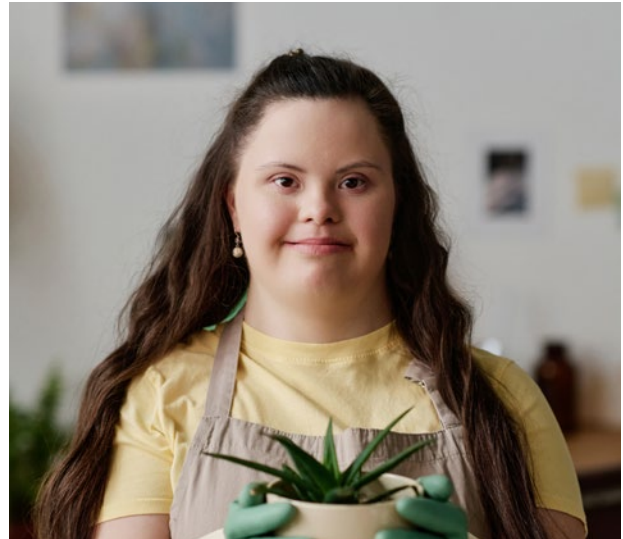
Image sourced from Adobe Stock, showing a person with disability holding a plant.

People with a disability often experience barriers to access and inclusion. Positive attitudes and respectful behaviour from Council demonstrates and encourages greater community inclusion of people with a disability in our community.