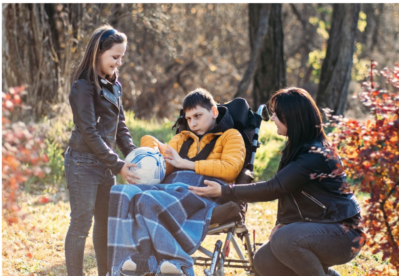
Image sourced from Adobe Stock, showing a person with disability amongst family.

“Increase the number of people with disability in meaningful employment, thereby enabling people with disability to plan for their future and exercise choice and control as a result of economic security.”