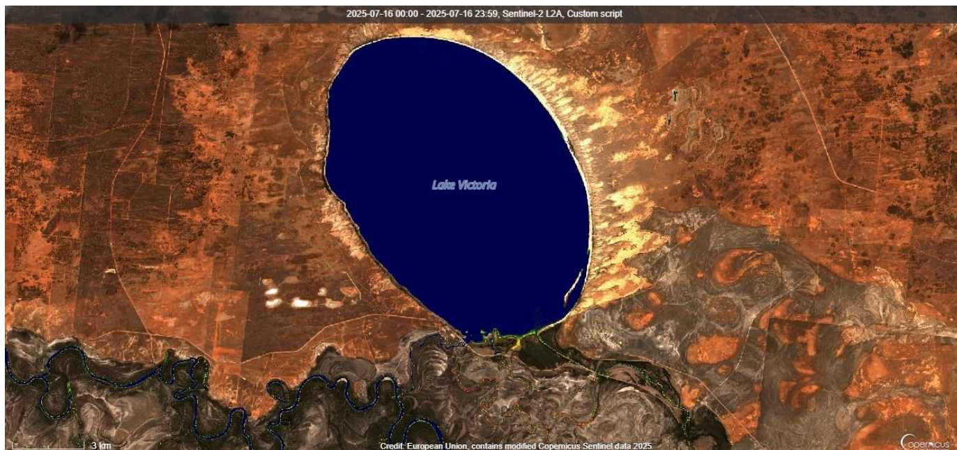
Figure 4: Lake Victoria 16/07/2025 SentinelHub [CC BY-NC 4.0] NSW-Custom Algae Script - TF, WaterNSW.