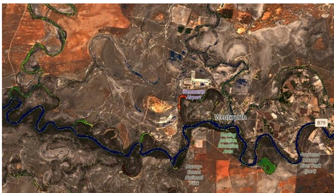
Figure 3: Murray River near Wentworth, Lower Darling River and Great Darling Anabranch 16/07/2025 SentinelHub [CC BY-NC 4.0] NSW-Custom Algae Script - TF, WaterNSW.