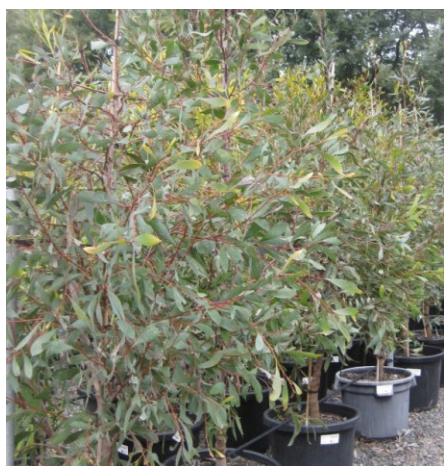
Hakea Laurina - Pincushion Hakea