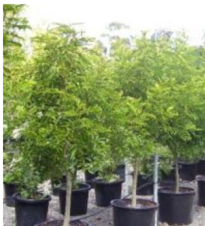
Fraxinus Griffithii - Evergreen Ash