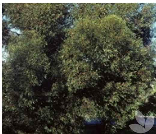
Wilga Tree - Gerijera Parvifolia