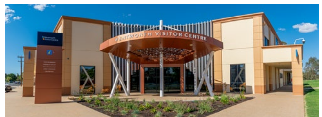
Wentworth Visitor Centre (Main Administration Office) 61 Darling Street, Wentworth NSW 2648