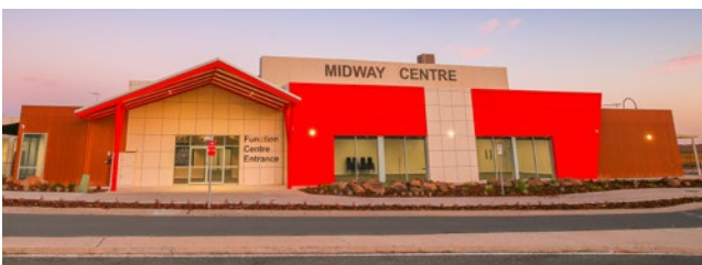
Midway Community Centre 3 Midway Drive, Buronga NSW 2739