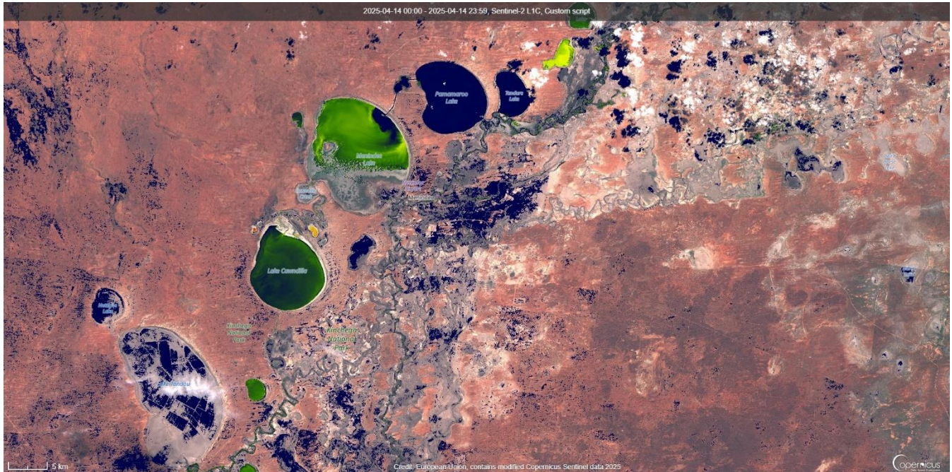
Figure 2: Menindee Lakes 14/04/2025 SentinelHub [CC BY-NC 4.0] NSW-Custom Algae Script - TF, WaterNSW.