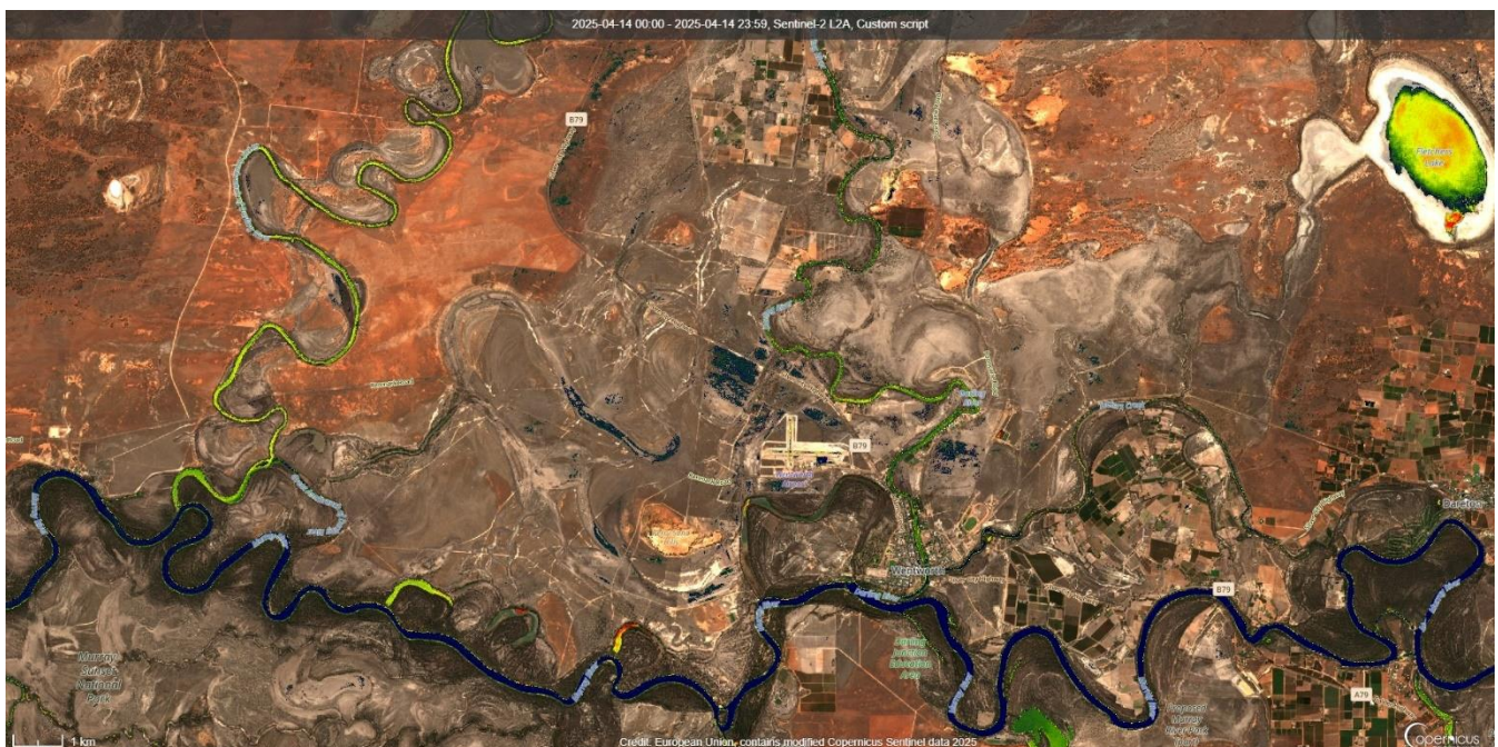
Figure 3: Murray River near Wentworth, Lower Darling River and Great Darling Anabranch 14/04/2025