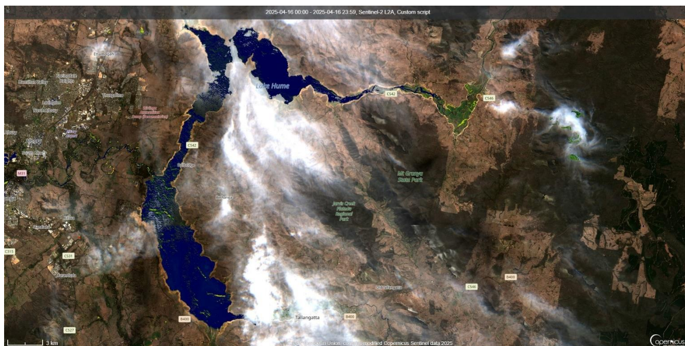
Figure 1: Hume Dam 16/04/2025 SentinelHub [CC BY-NC 4.0] NSW-Custom Algae Script - TF, WaterNSW.

Lake Victoria had very low to high phytoplankton activity on 15/04/2025 (Figure 4).