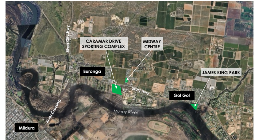
Figure 1 – Buronga and Gol Gol sporting facilities

There are currently four sporting clubs in Buronga and Gol Gol: