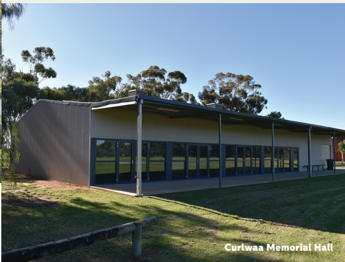
Curlwaa Memorial Hall