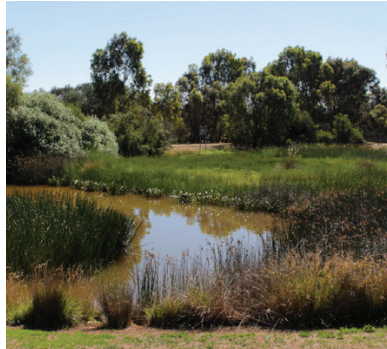
Wetland planted with ephemeral and aquatic species to detain and cleanse stormwater