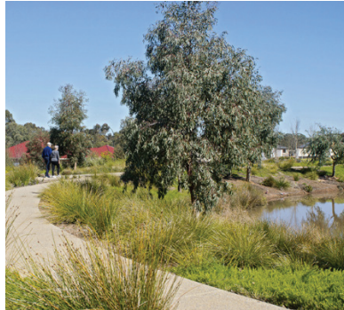
Walking path surrounding wetland

Wentworth Shire Council is seeking community feedback on an exciting upgrade to public open space at 48 Dawn Avenue, Gol Gol. Council invites you to participate in shaping its future with plans to enhance the drainage basin area into a vibrant community space.