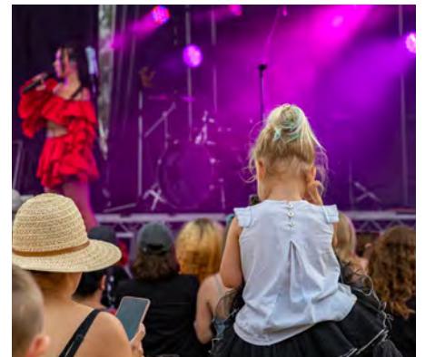
Mallrat was favoured by all ages

Local food and drink vendors served up a storm to over 3,000 attendees and included a range of options from; Monak Wine Co, Trentham Estate Winery, Fossey's Distillery, Cappa Stone Wines, Scad's Cruisin Café, The Van, El Gringo's Mexican Street Food, Peter's Souvlakis, Outback Almonds, Verdict pop up catering, Two Black Sheep Cafe, Enjoy Catering Mildura, Grazing Into Brunch and the Lions Club of Buronga Gol Gol & Friends of the Gardens Committee.