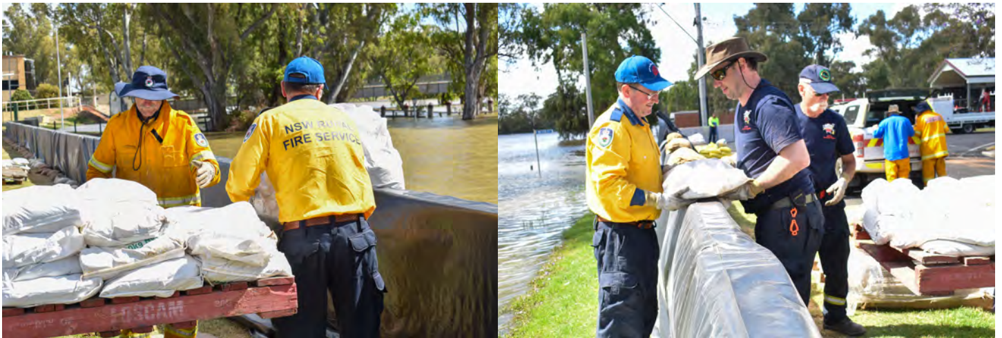
NSW Rural Fire Service placing sandbags at the temporary wall at Wentworth Wharf