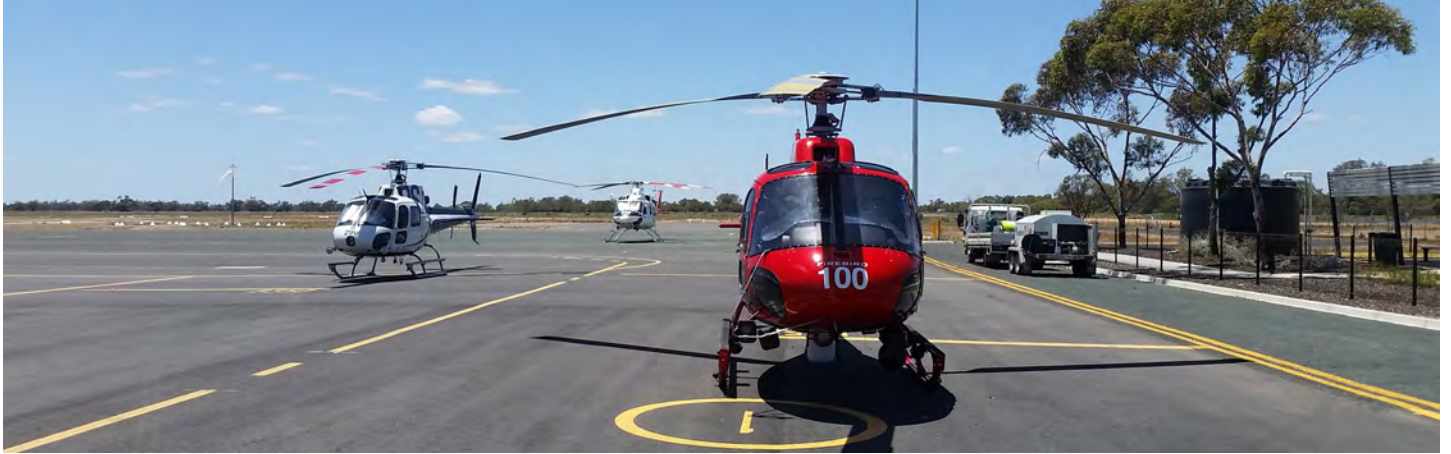
Helicopters at Wentworth Aerodrome during the floods