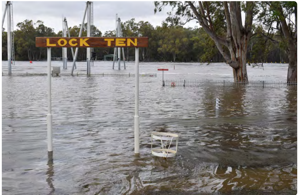
Flooding at Lock 10, Wentworth