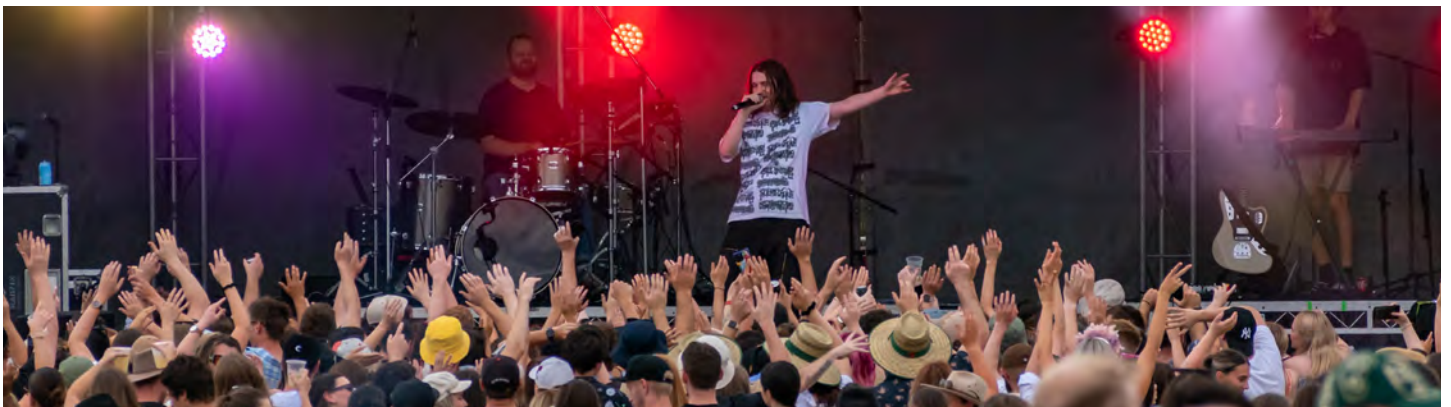
Artist, Allday entertains the crowd