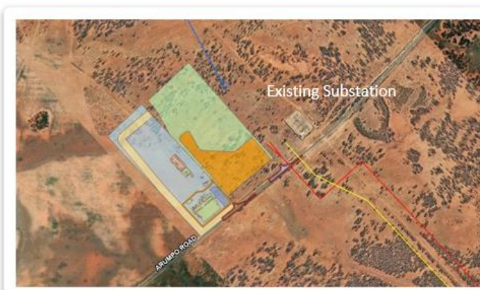
Image 2: Buronga Camp and Laydown on Arumpo Road opposite the Buronga substation