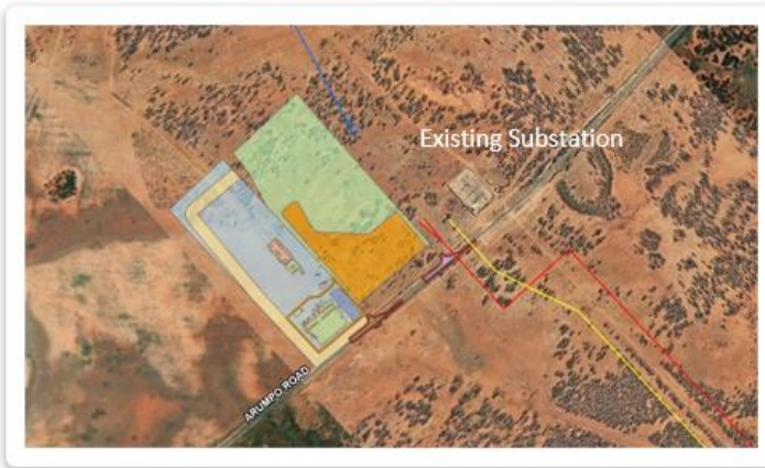
Image 2: Buronga Camp and Laydown on Arumpo Road opposite the Buronga substation