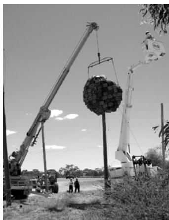
Dip tin being erected in 2005

The Mayor went on to say that she looked forward to seeing the sculpture in its new surrounds.