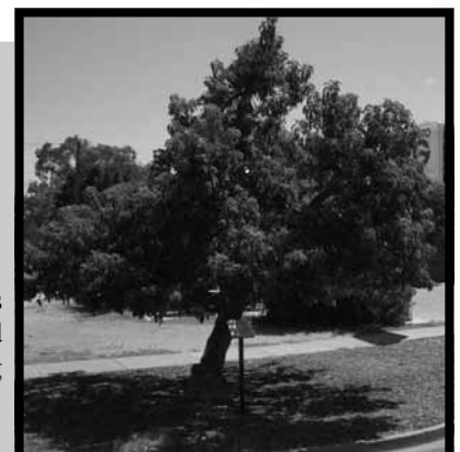
Pictured Right: The famous Inkberry tree has been saved with manual watering using recycled water